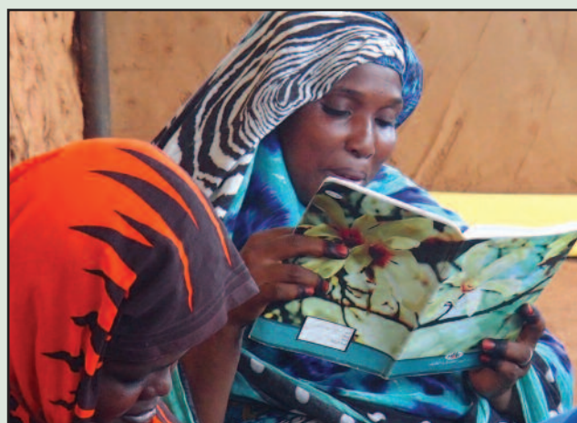
Education for disadvantaged women is at the heart of all we do in Sudan.