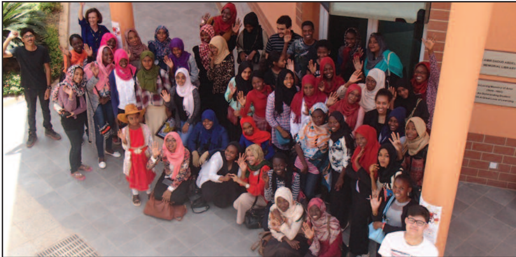
Above: Our undergraduates are welcomed each Saturday morning at Khartoum International Community School. KICS students teach them English and help them become more confident in telling their stories.